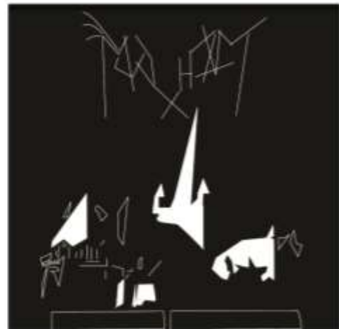
Picture 4a. Tracing of composition by the authors