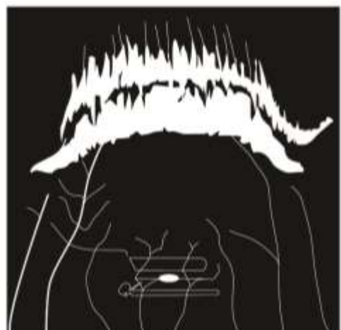
Picture 5a. Tracing of composition by the authors