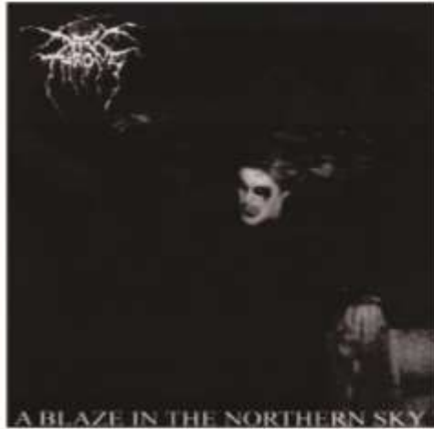
Picture 3. A Blaze in the Northern Sky , Darkthrone, 1992