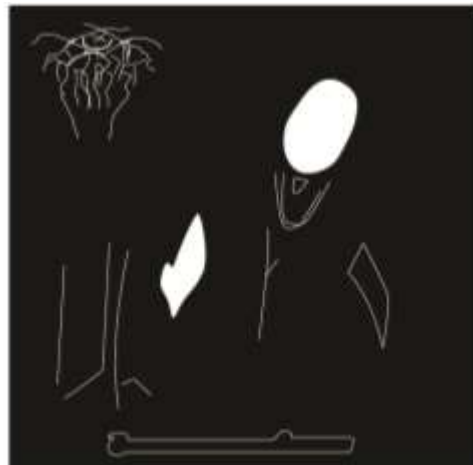
Picture 1a. Tracing of composition by the authors