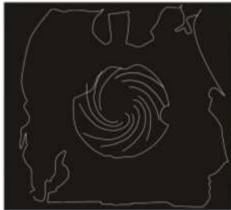
Picture 6a. Tracing of composition by the authors