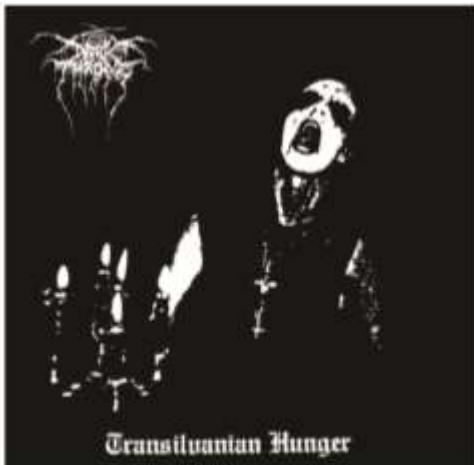
Picture 1. Transilvanian Hunger , Darkthrone, 1994