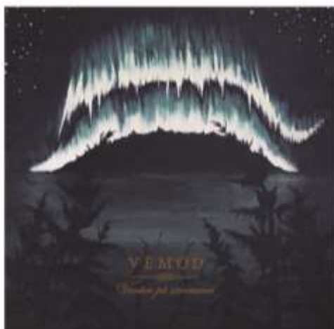
Picture 5. Hinter på stormene , by Vemod, 2012 Reproduced with permission from Vemod