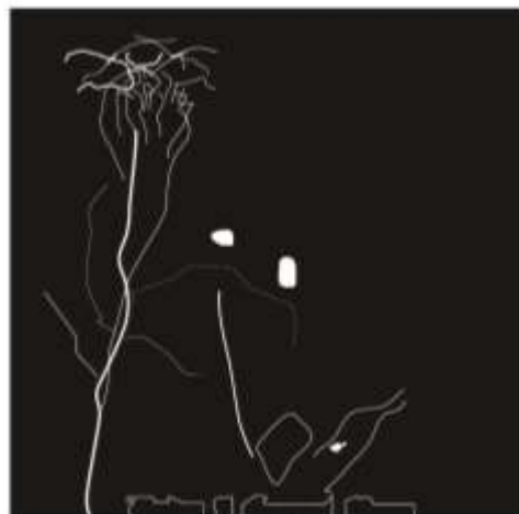
Picture 2a. Tracing of composition by the authors