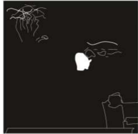
Picture 3a. Tracing of composition by the authors