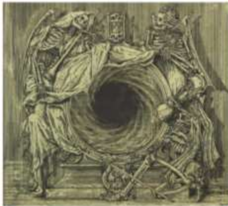
Picture 6. Lawless Darkness , by Watain, 2010 Reproduced with permission from Watain