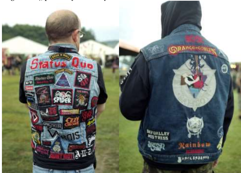
Figure 3: Examples of hand embroidered jackets, Bloodstock Festival, UK, August 2014