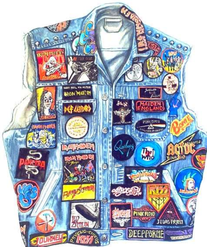
Figure 1: Tom Helyar-Cardwell Aiden's Jacket Front , watercolour on paper, 38 x 26 cms, 2014

In what follows, the importance of DIY culture and craft practice in battle jacket making will be considered in relation to cultural hierarchies in order to make comparisons with the history of painting.